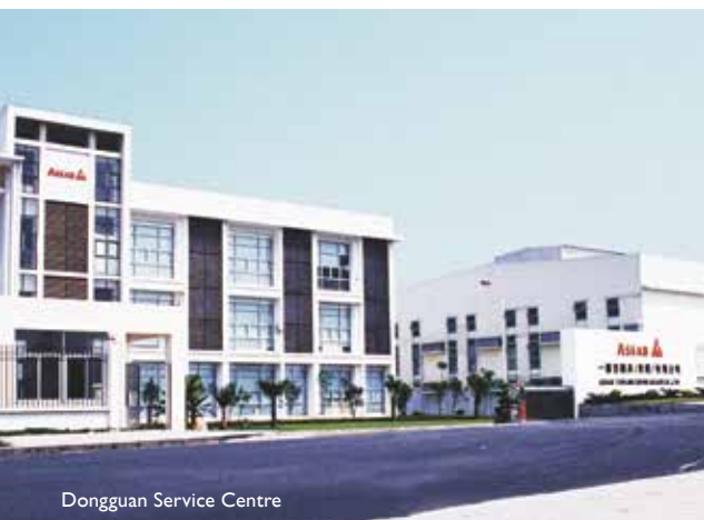
Dongguan Service Centre