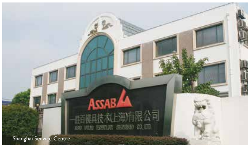
Shanghai Service Centre