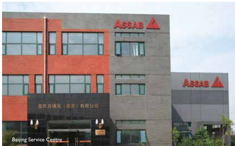
Beijing Service Centre

Our unique range of complementing services e.g.machining, heat treatment, etc; also includes tool design consultancy using STRACK Normalien tooling components, high quality coating e.g. PVD, laboratory and failure analysis. ASSAB China has the expertise and capabilities to provide you, our customer, with a "one stop" solution for all your steel and tooling needs.